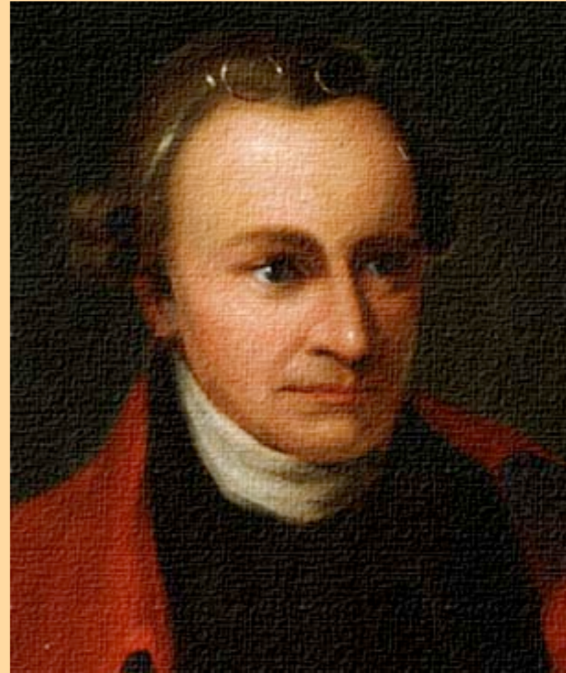
Patrick Henry “Give me liberty or Give me death”