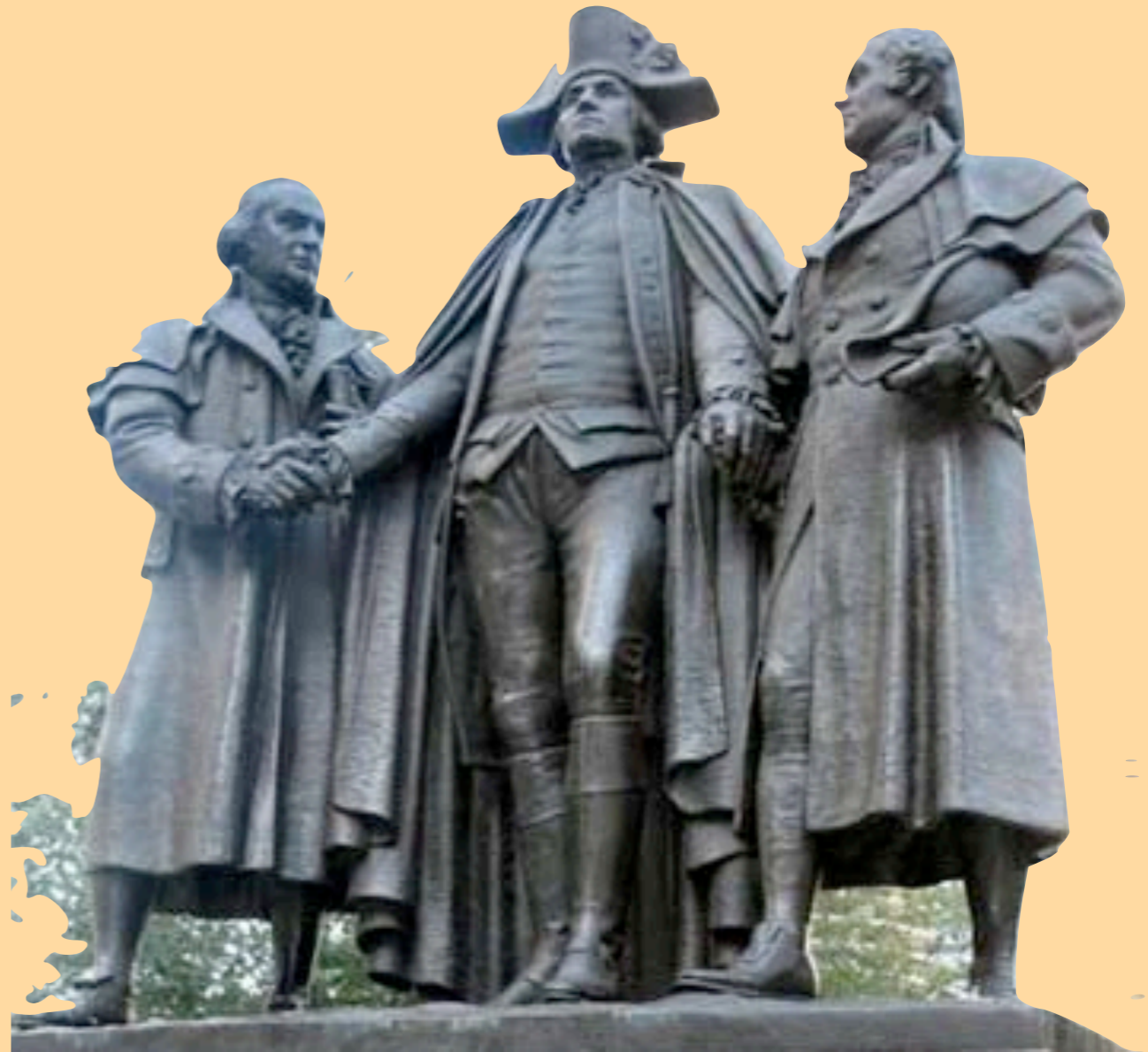
Washington flanked by Robert Morris and Chaym Salomon