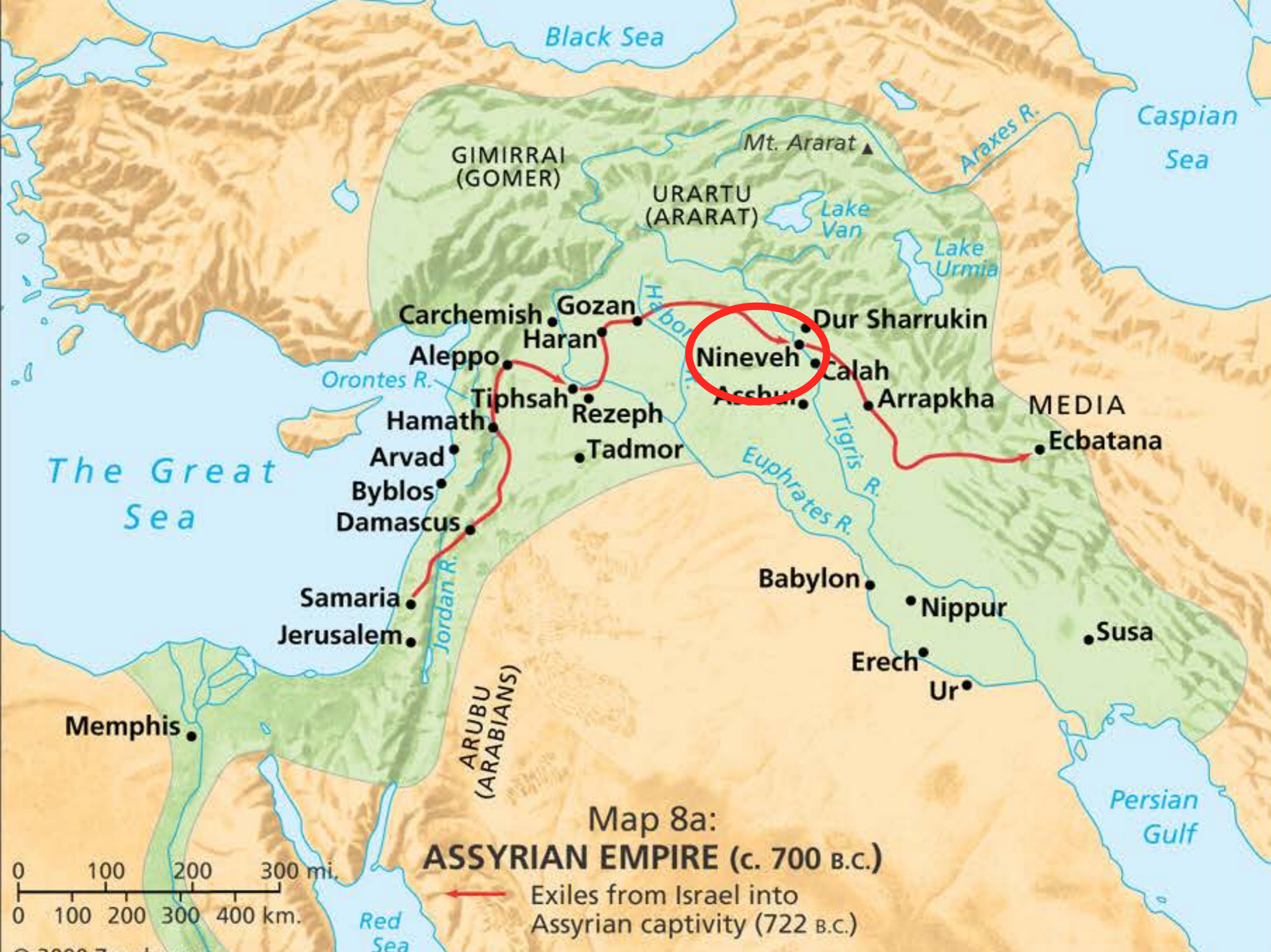
Map 8a: ASSYRIAN EMPIRE (c. 700 B.C.)

← Exiles from Israel into Assyrian captivity (722 B.C.)