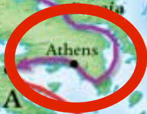
PAUL'S FIRST AND SECOND