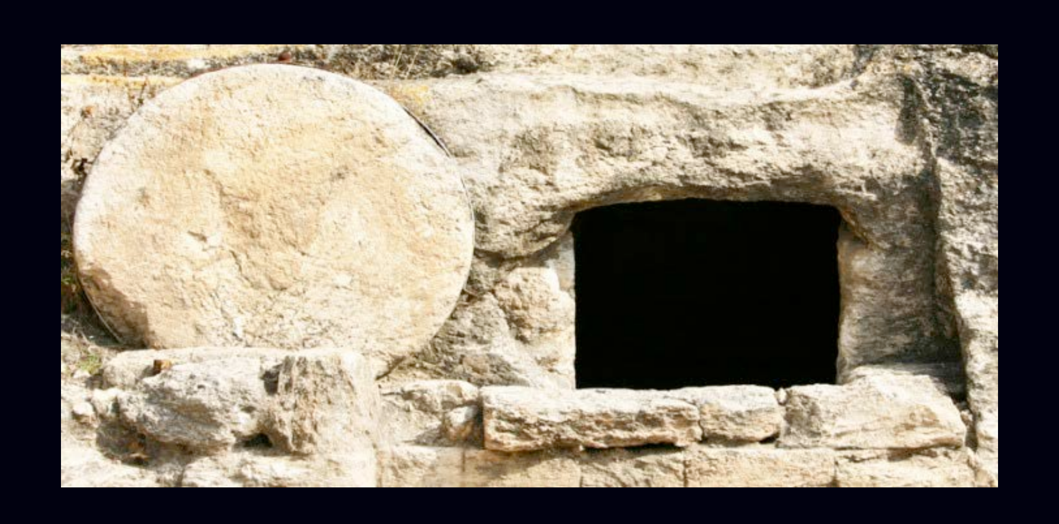
Resurrection Day, 2015