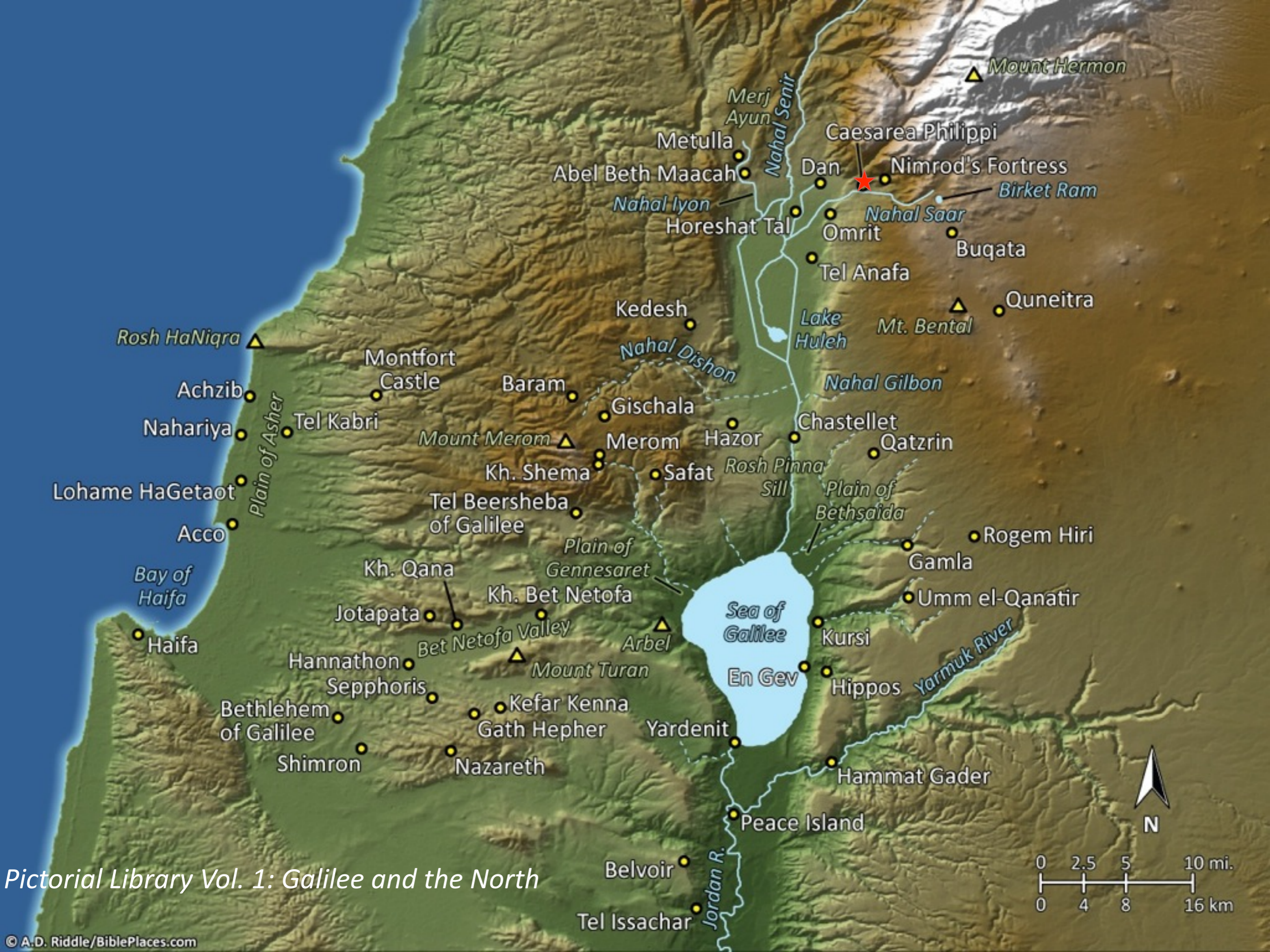
Pictorial Library Vol. 1: Galilee and the North