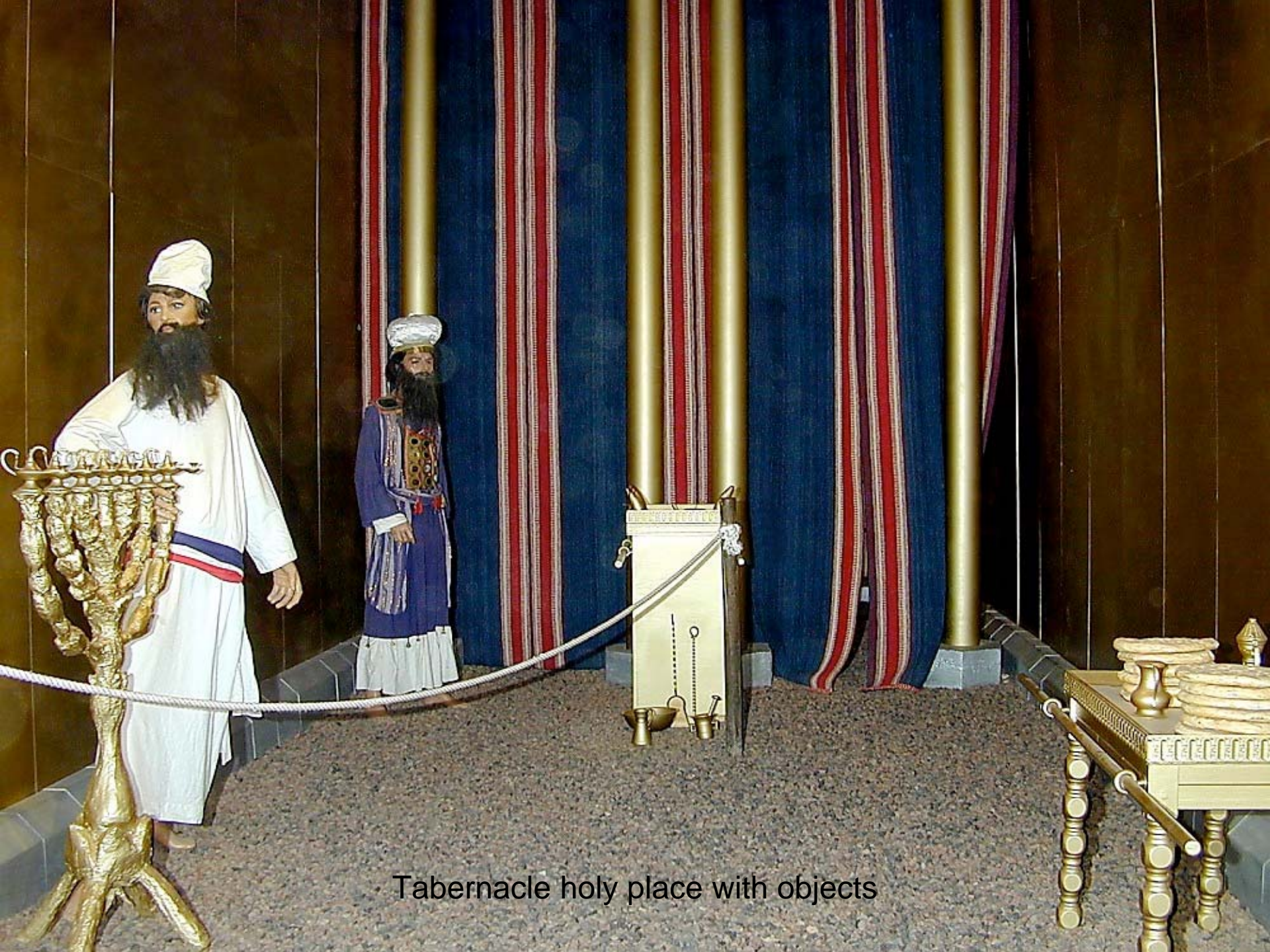
Tabernacle holy place with objects