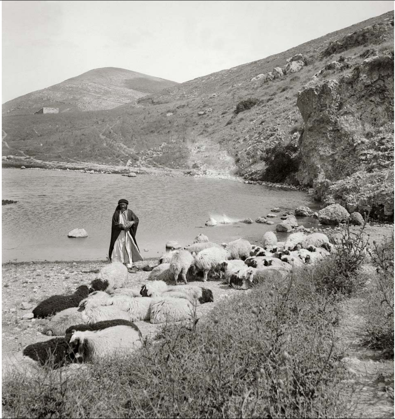
Ein Harod, Gideon's Fountain