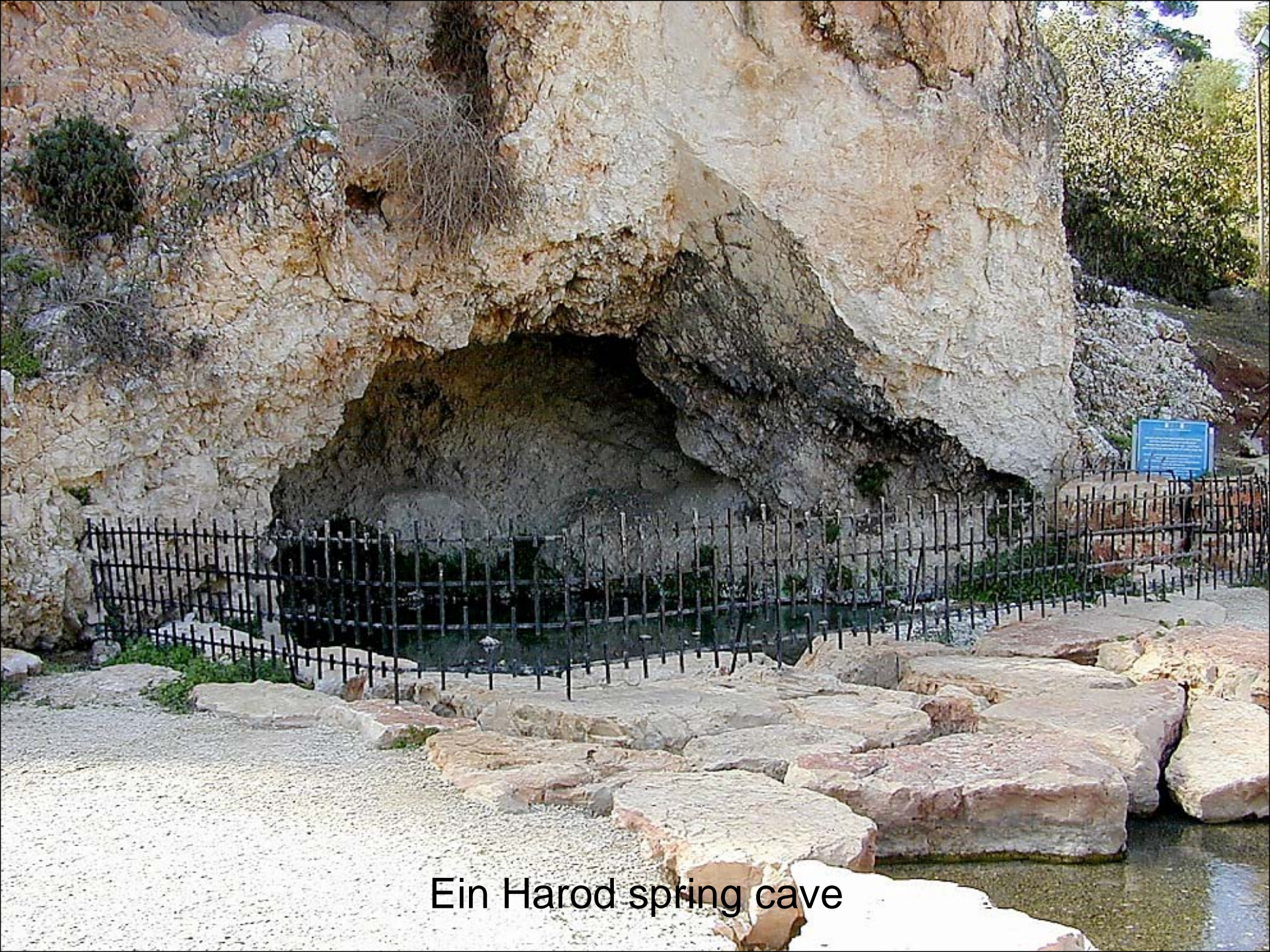
Ein Harod spring cave