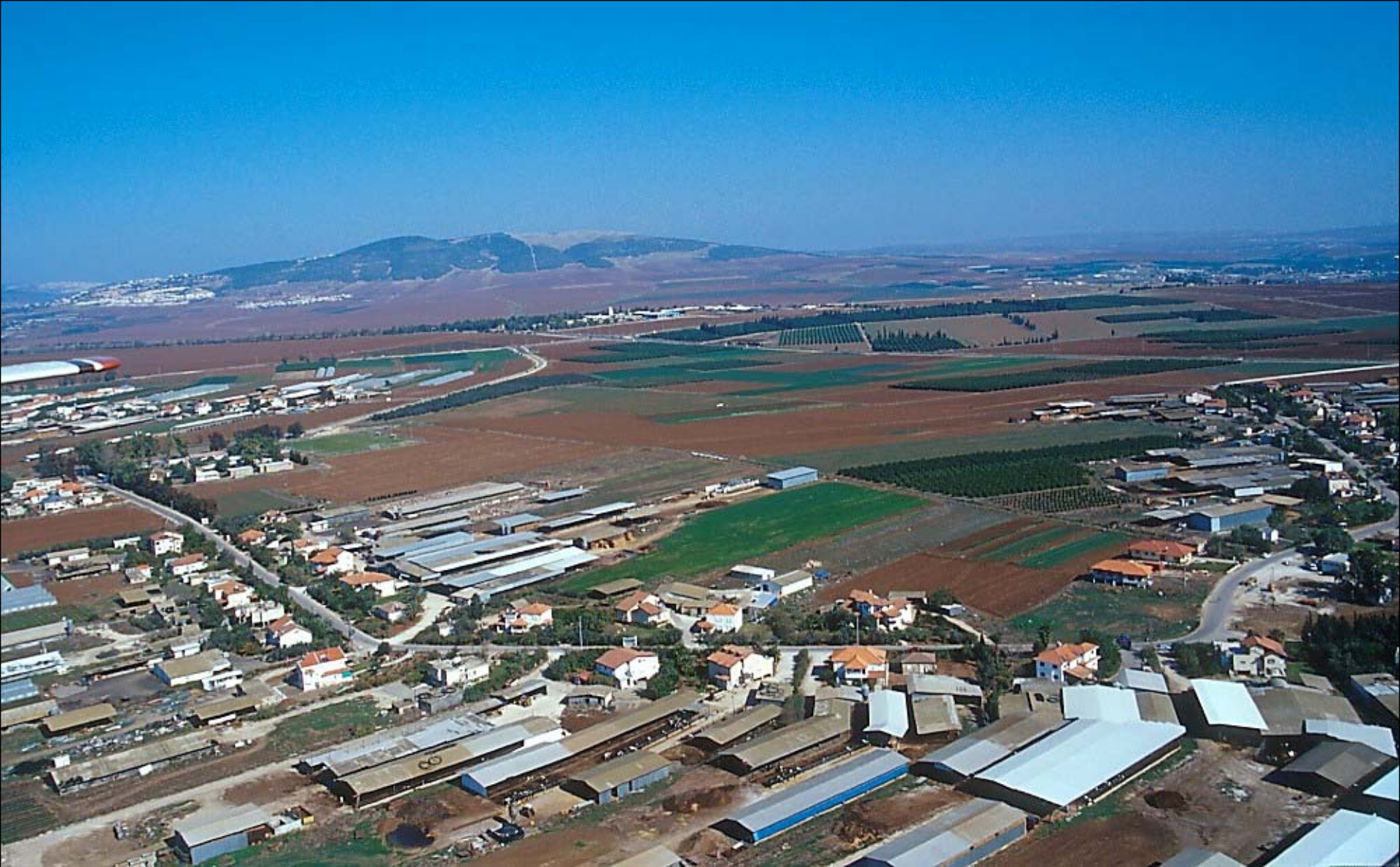
Jezreel Valley and Hill of Moreh from south aerial