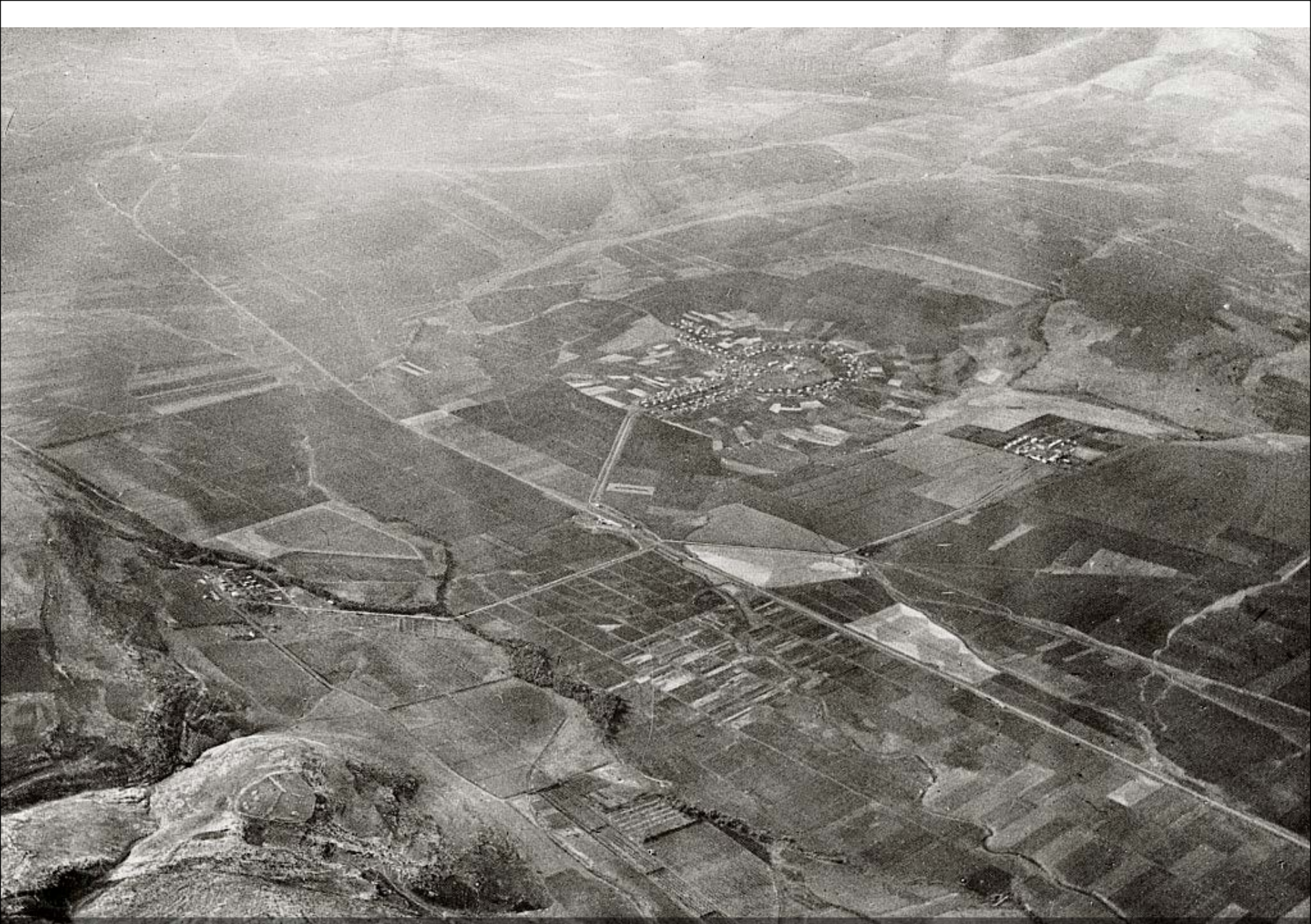
Jezreel Valley, aerial view with Gilboa and Ein Harod