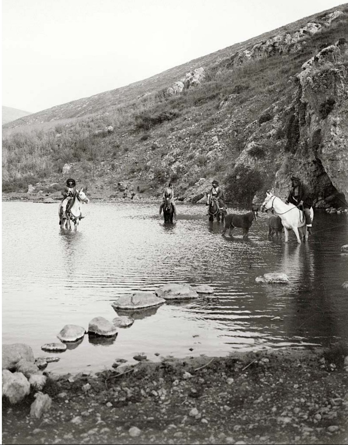
Ein Harod, Gideon's Fountain