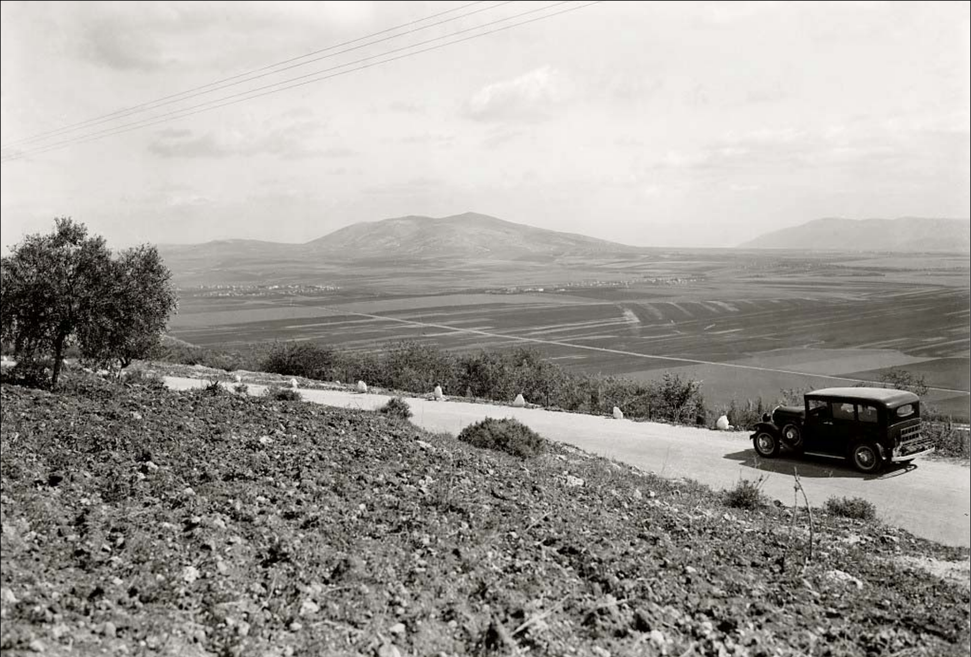
Jezreel Valley, Hill of Moreh from Nazareth Ridge