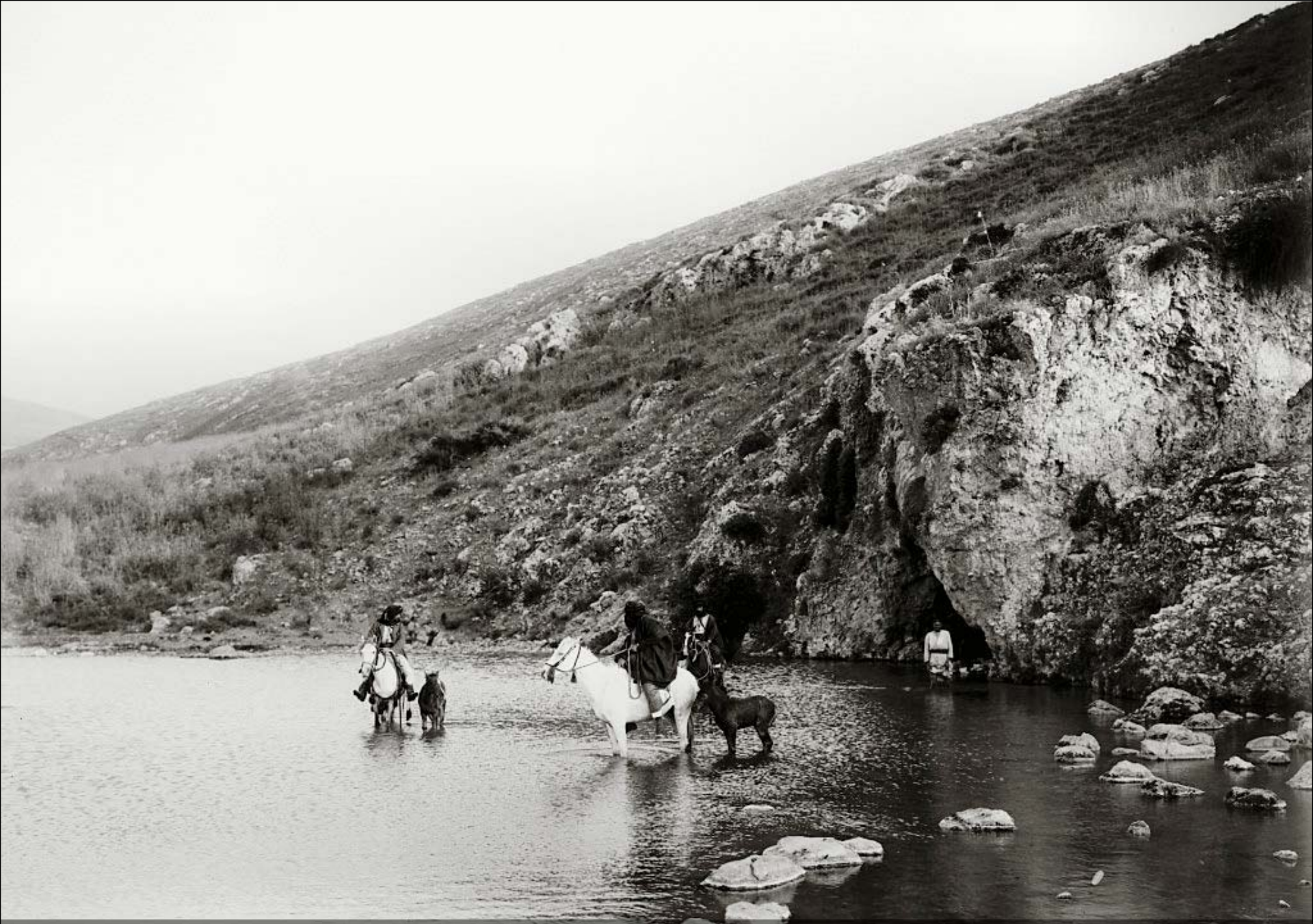
Ein Harod, Gideon's Fountain