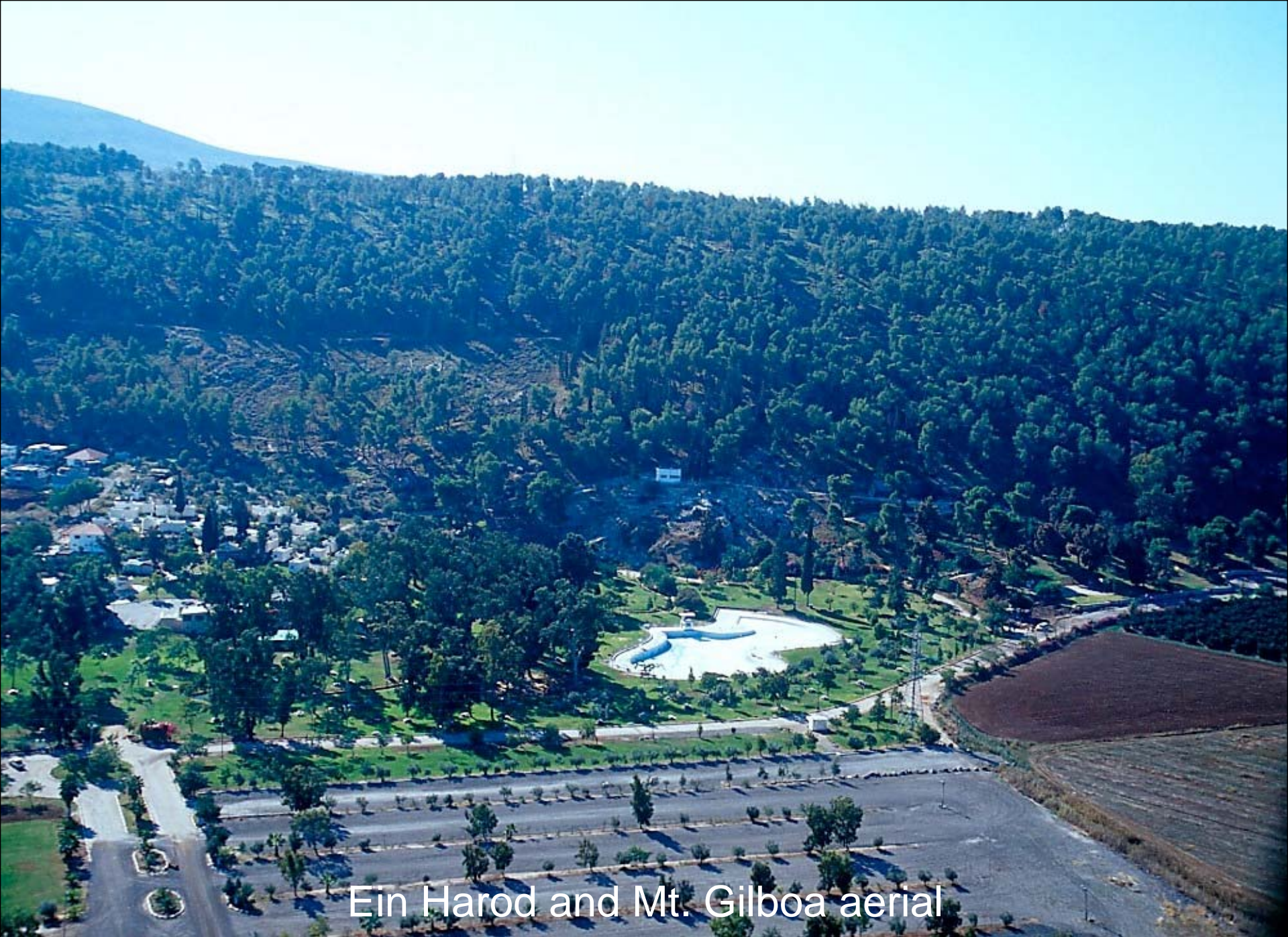
Ein Harod and Mt. Gilboa aerial