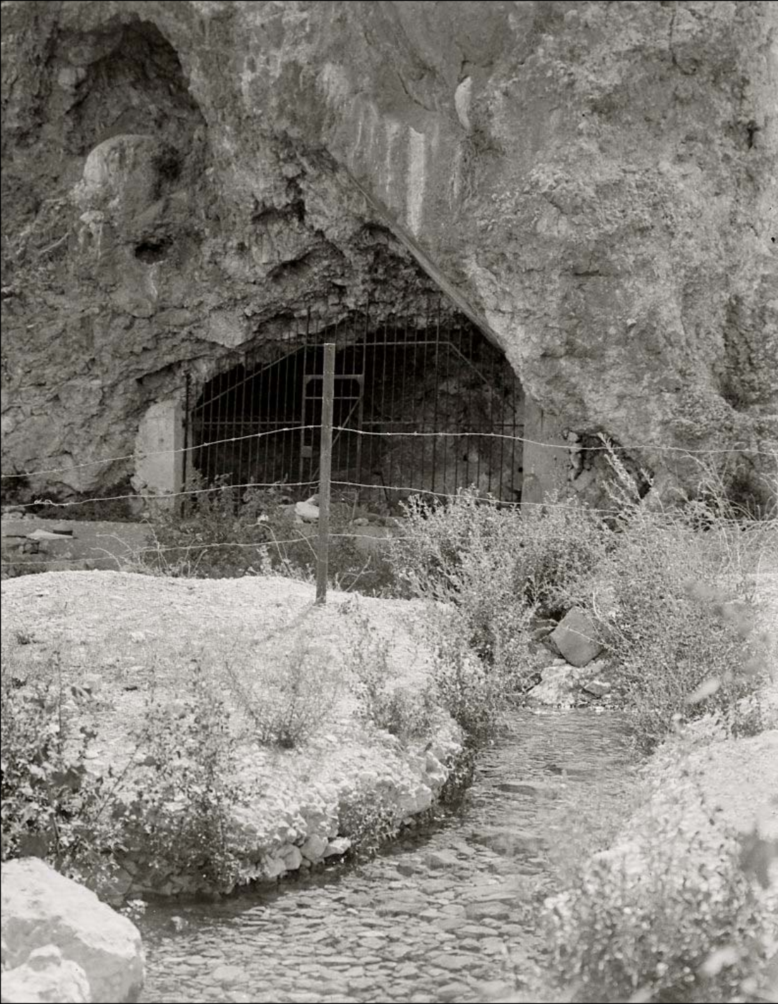
Ein Harod, Gideon's Fountain modernized