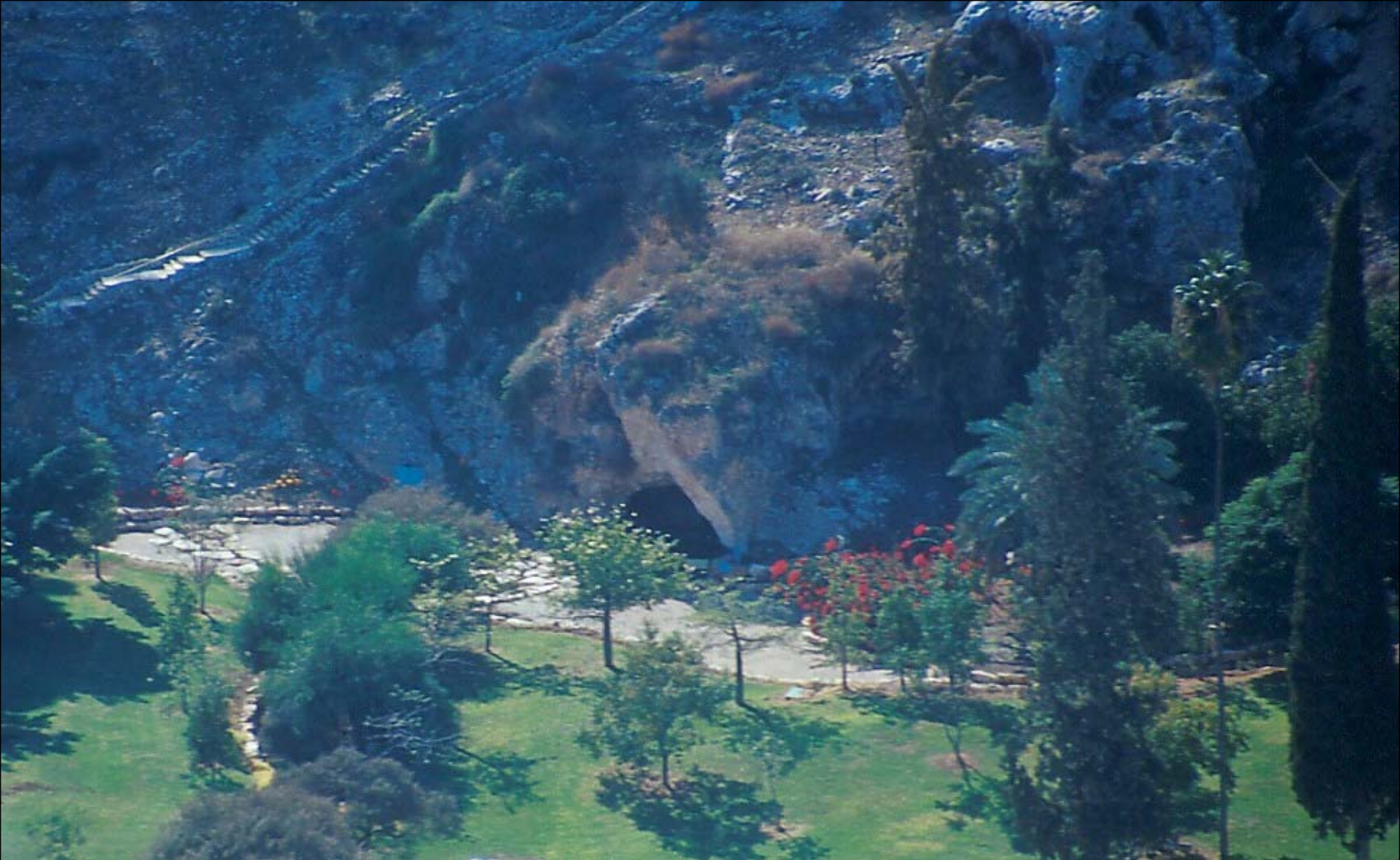
Ein Harod closeup aerial