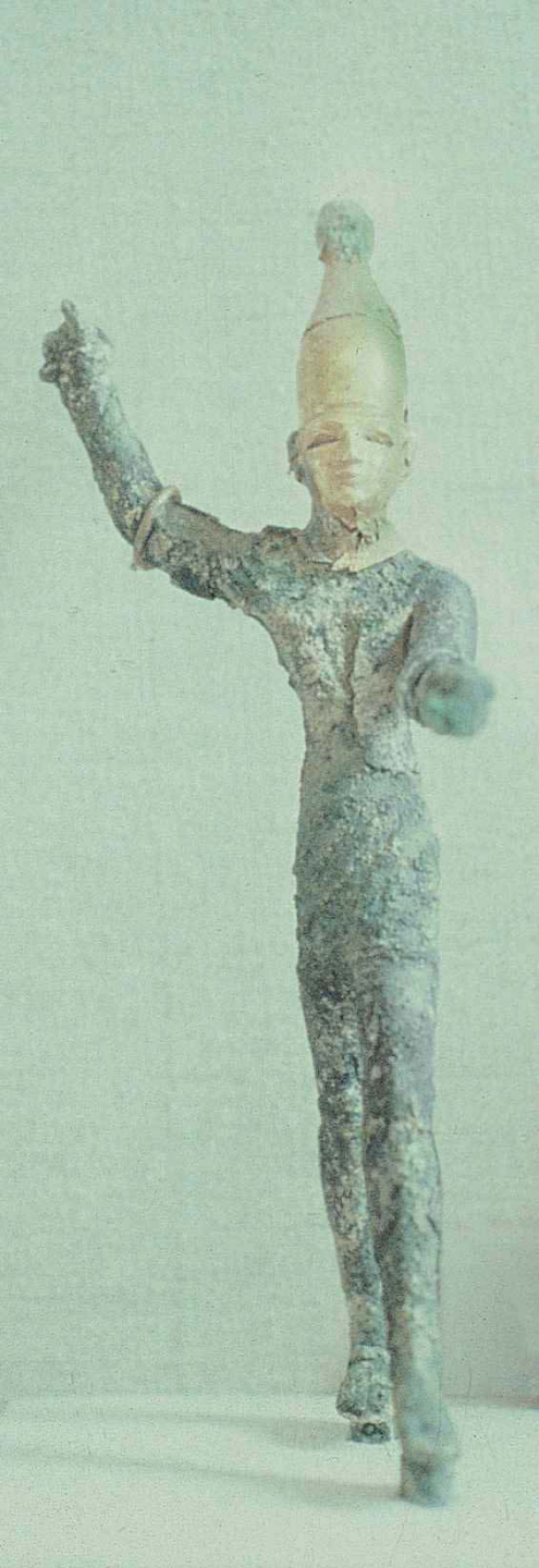
Statuette of Baal, the Canaanite weather god,” from Minet-el-Beida (15th–14th century B.C.).