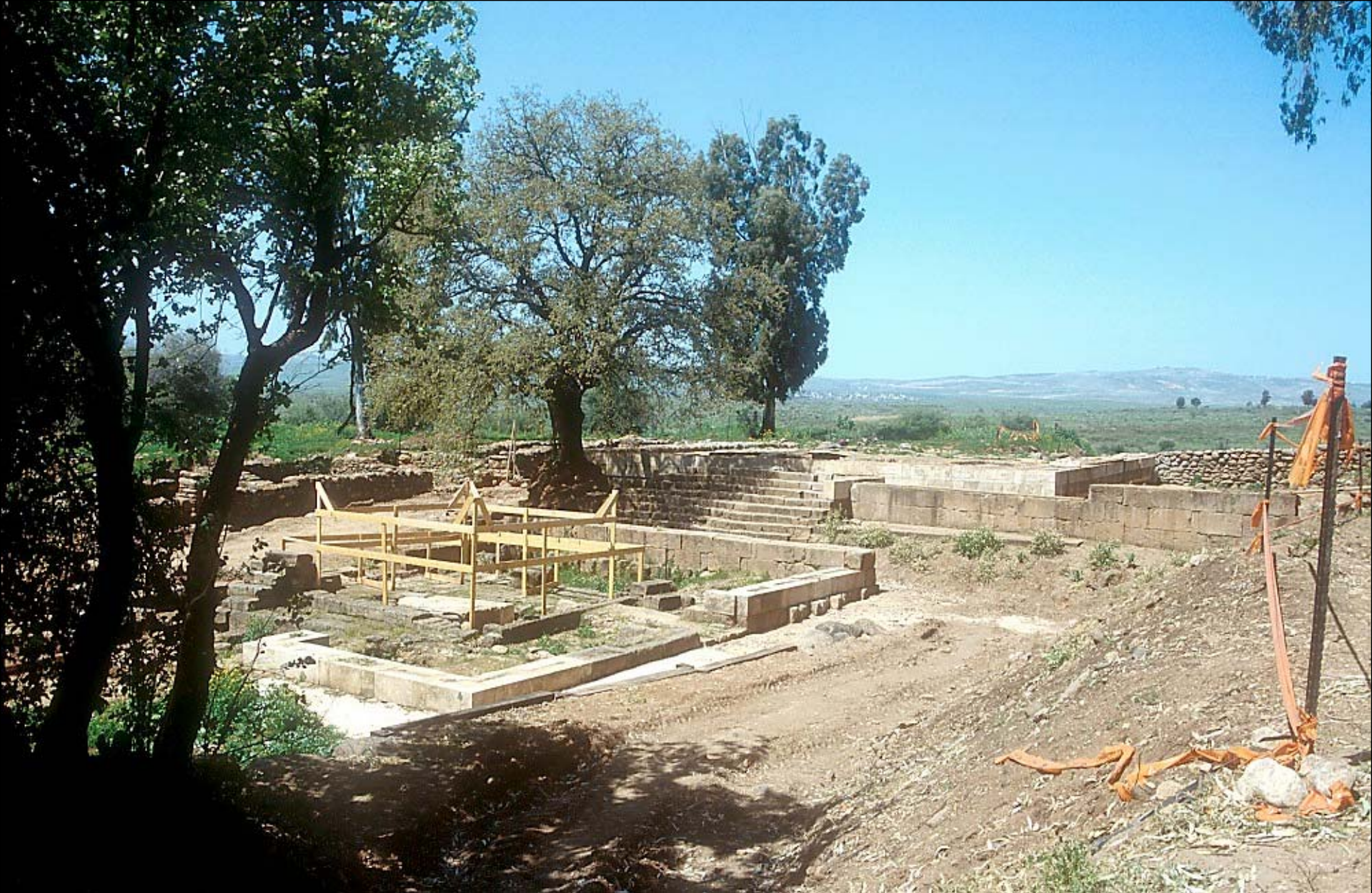
High place of Dan