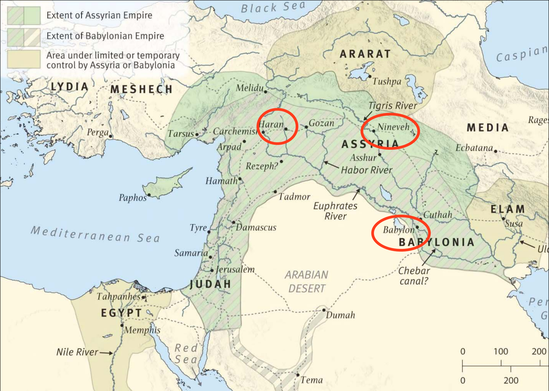
Assyrian and Babylonian Empires