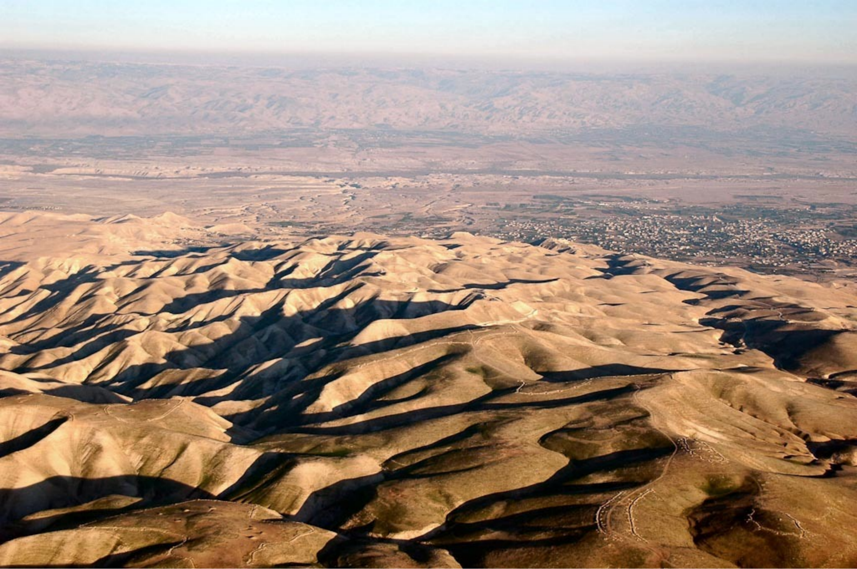
Jericho area aerial from west