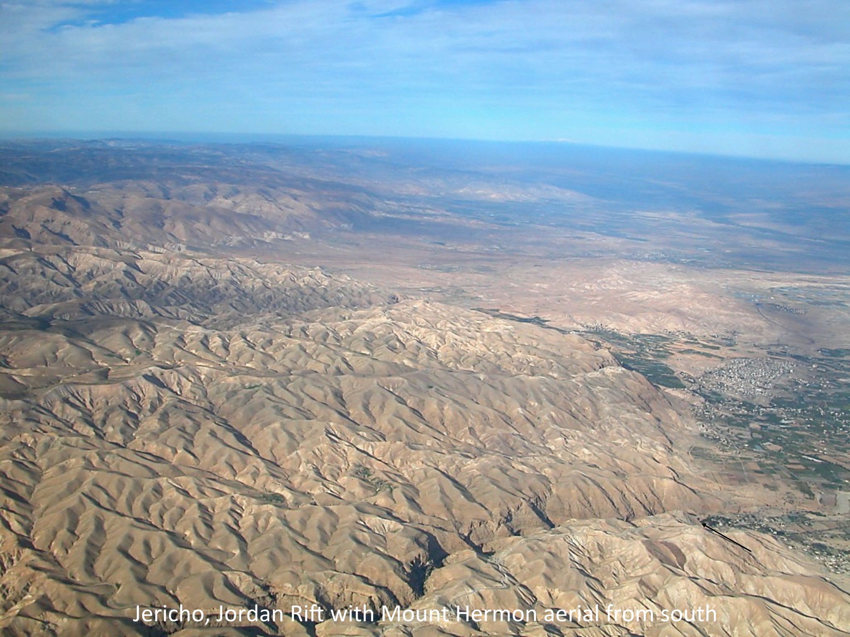
Jericho, Jordan Rift with Mount Hermon aerial from south