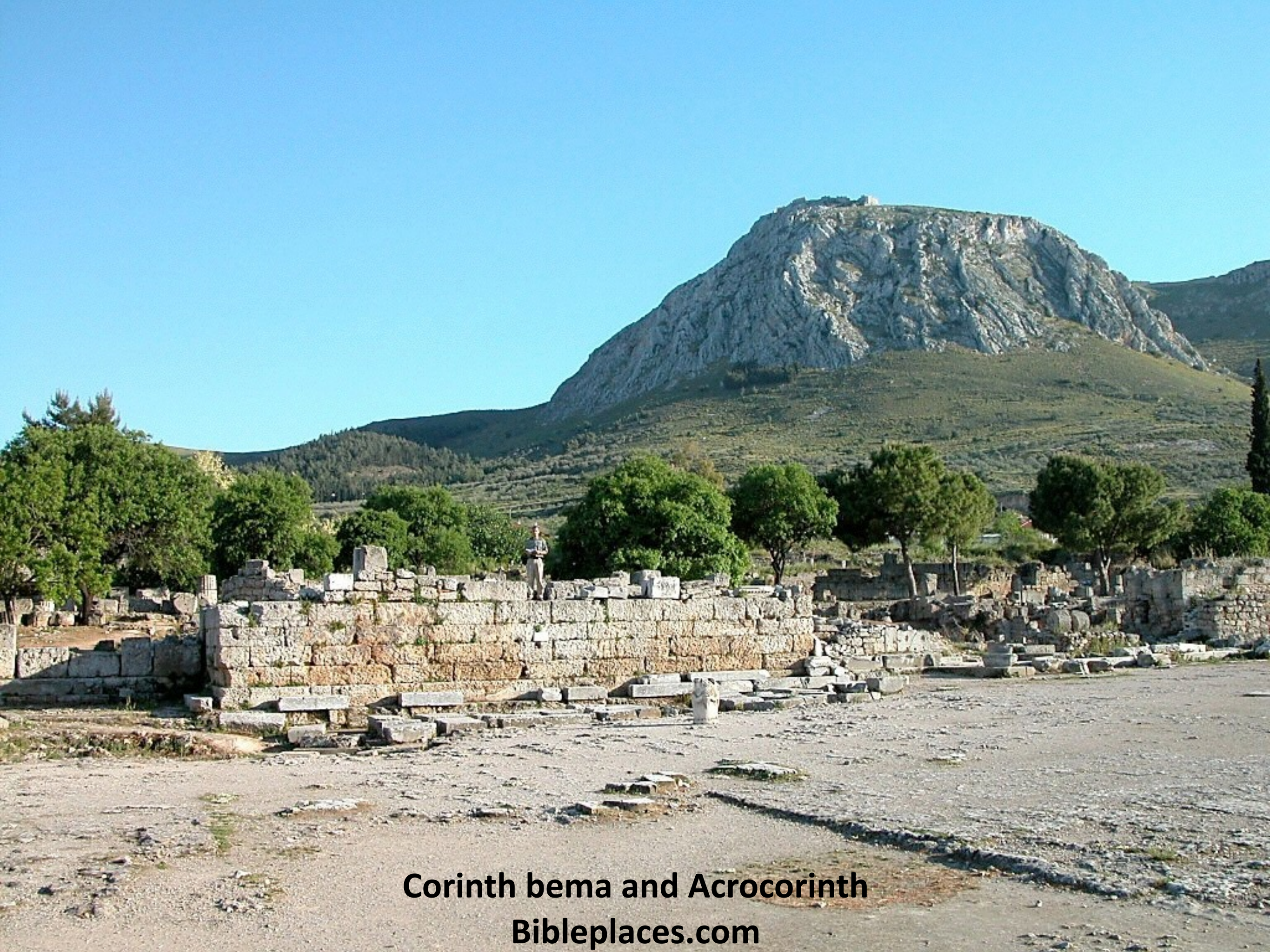
Corinth bema and Acrocorinth