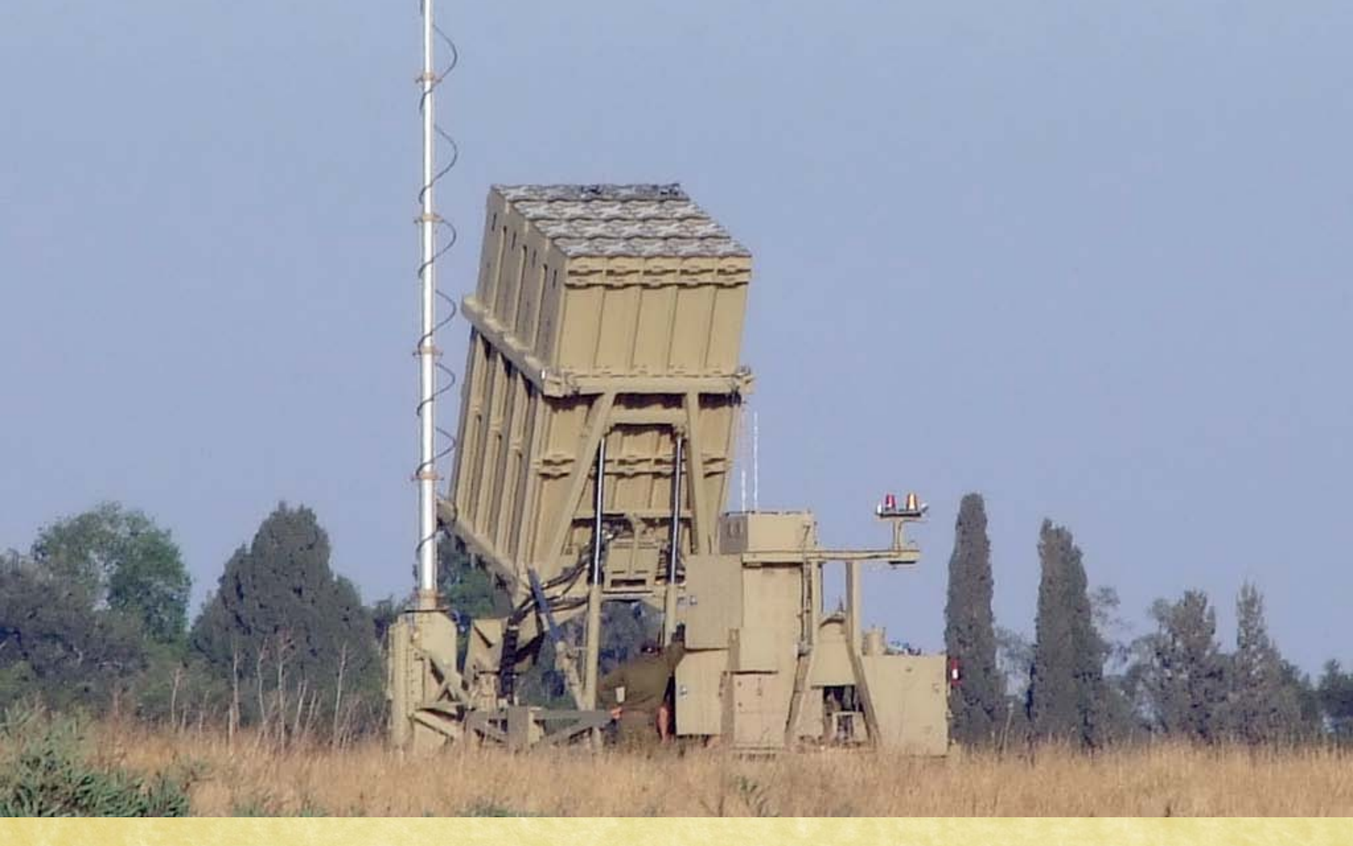
Iron Dome Defense Shield