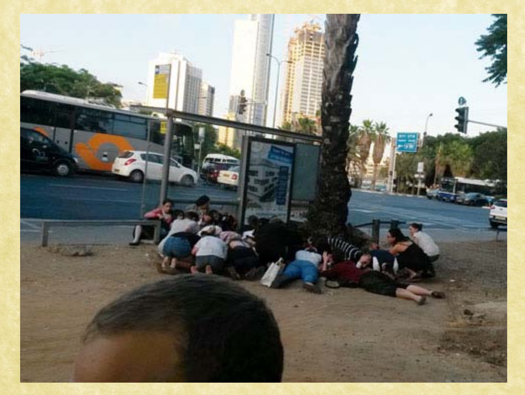
Tens of thousands of Israelis live where they only have 15 seconds to get to a bomb shelter