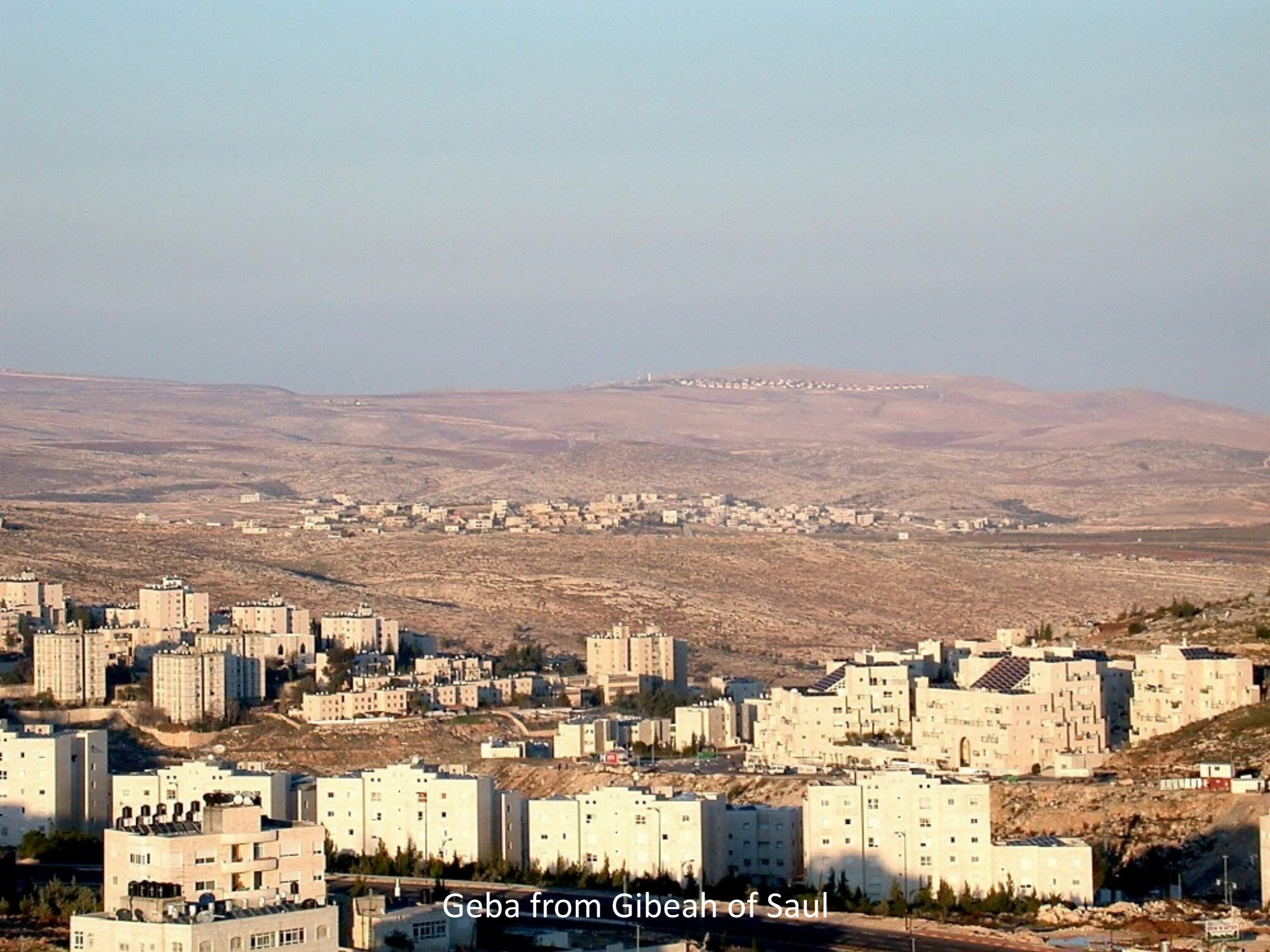
Geba from Gibeah of Saul